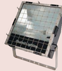
The 864 with wire guard