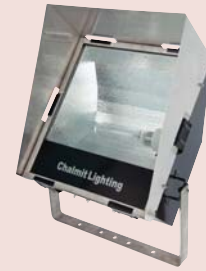
The 864 with anti-glare shield

The 800 series is a range of stainless steel asymmetrical floodlights. These floods are designed for optimum light output and efficiency to ensure the minimum number of luminaires is required.