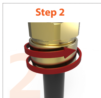
Tighten backnut until a seal is formed onto the cable, then tighten one further turn