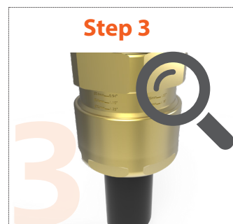
The backnut should be level with the marking guide corresponding to its diameter – this can be visually inspected and adjusted as necessary