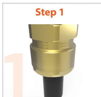
Follow cable gland installation instructions until final stage – tightening of rear seal

The gland is permanently marked with various lines/numbers indicating the correct tightening level related to the cable diameter. Following the relevant cable gland Installation Instructions, the back seal should be tightened until a seal is formed on the cable outer sheath and then tightened one further turn.